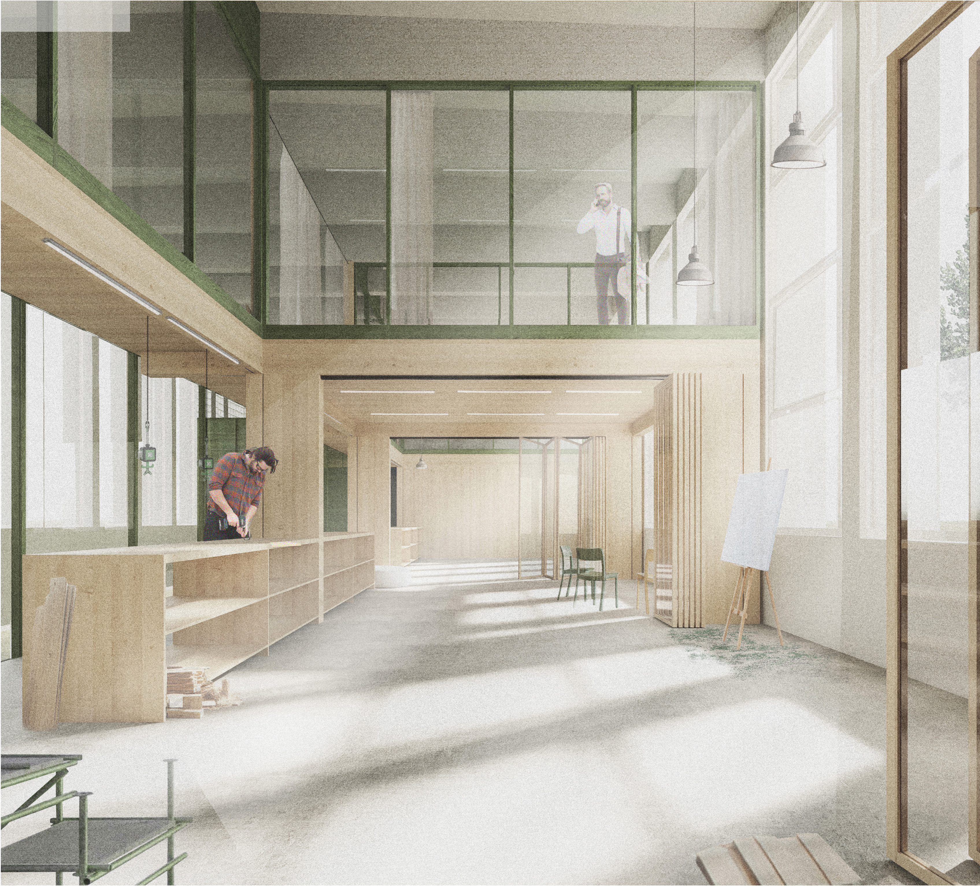
Space for various workshops - first floor